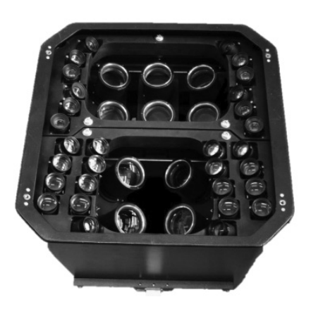
Fig. 2. The Russian OSDCAM 4060 digital sensor

and sensors, an inspection of the process of creating OSDDEF files and determining H_{min} for each configuration. The Russian certification, being the first digital sensor certification in Open Skies history, was slightly problematic and raised a number of new problems which needed to be promptly addressed by the IWGS. Despite technical problems, the certification was in the end a success and the first observation flight utilizing the OSDCAM 4060 was conducted in July 2014 over the territory of Poland.