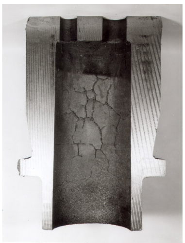
Fig. 1. Vertical section of casting with defects on inner surface

If users want to identify a defect, in the opening screen of ES (Fig. 2) they select an option called 'Identification of defect based on external (visual) attributes' and click on the button marked [>].