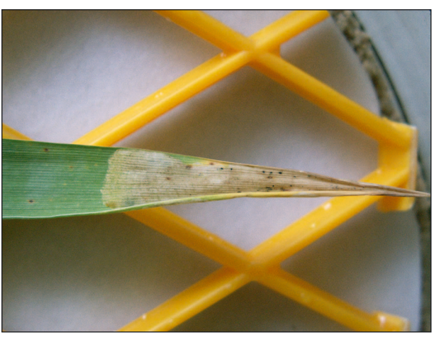
Fig. 5. Winter wheat leaf damaged by larval stage of P. superciliosa