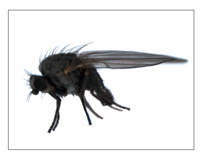
Fig. 3. Imago of Chromatomyia nigra (Ztt.)