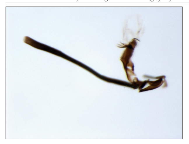
Fig. 2. Male genitalia structure C. nigra (Ztt.)