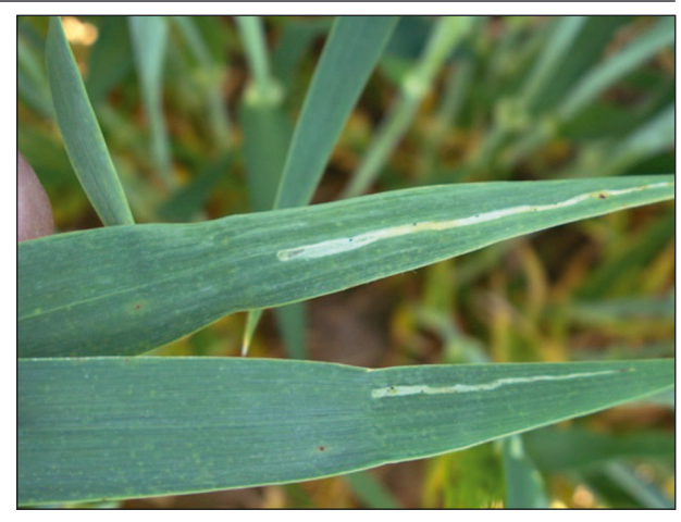
Fig. 4. Winter wheat leaves damaged by larval stage of C. fuscula