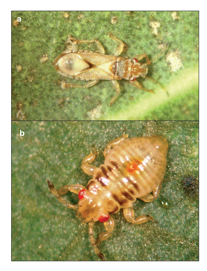
Fig. 1. T. peregrinus: a) adult, b) nymph

In 2008, the bronze bug Thaumastocoris peregrinus Carpintero and Dellapé 2006 (Hemiptera: Thaumastocoridae: Thaumastocorinae), a pest also threatening eucalyptus plantations was detected in Brazil. The insect is a small phytophage bug, with a flattened body, specific to Eucalyptus trees (Fig. 1a). It is approximately 3 mm long and very agile. The head has developed mandible plates, antenna with four segments, with dark apical segments. Short rostrum and pulvilli absent in the tarsus. Adults are light brown in color with darker areas. The male genital capsule is asymmetrical, with the opening at the right side (Carpintero and Dellapé 2006). It has five instars (Fig. 1b), with a developmental period of about 20 days at temperatures between 17 to 20°C (Noack and Rose 2007). Fecundity is close to 60 eggs. Eggs are black and laid in clusters on leaves and twigs (Fig. 2a). Feeding causes leaf whitening and bronzing (Fig. 2b), followed by drying and falling.