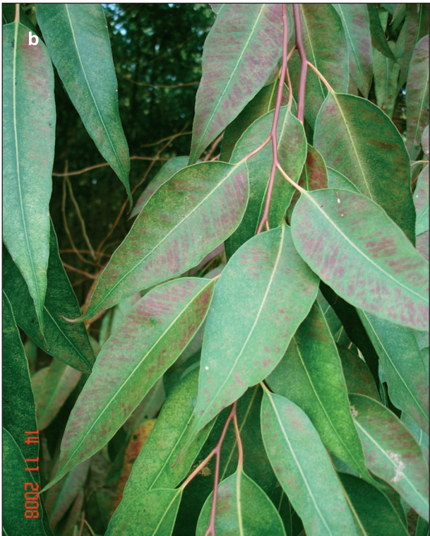
Fig. 2. a) egg cluster; b) symptoms of T. peregrinus damage on Eucalyptus leaves

Thaumastocoris occurs in Australia, where are four known species, and T. peregrinus is the only described species outside Australia (Carpintero and Dellapé 2006).