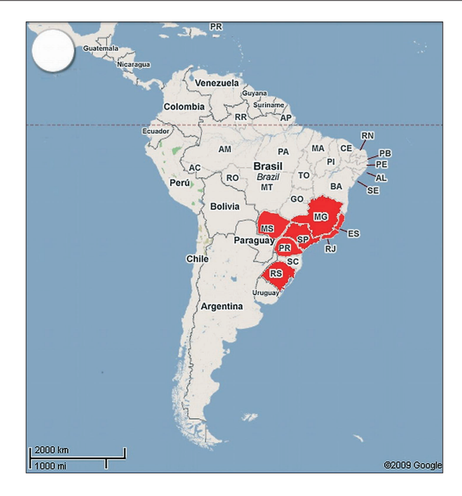
Fig. 3. Geographic distribution of T. peregrinus (Hemiptera: Thaumastocoridae) in Brazil. October, 2009 (SP: Sao Paulo; RS: Rio Grande do Sul, PR: Parana, MG: Minas Gerais, RJ: Rio de Janeiro, ES: Espírito Santo and MS: Mato Grosso do Sul)