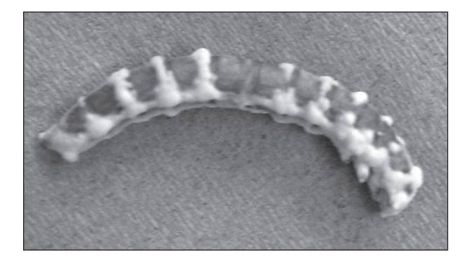
Fig. 3. Emergence of B. bassiana (isolate BEH) from dead larvae of T. molitor