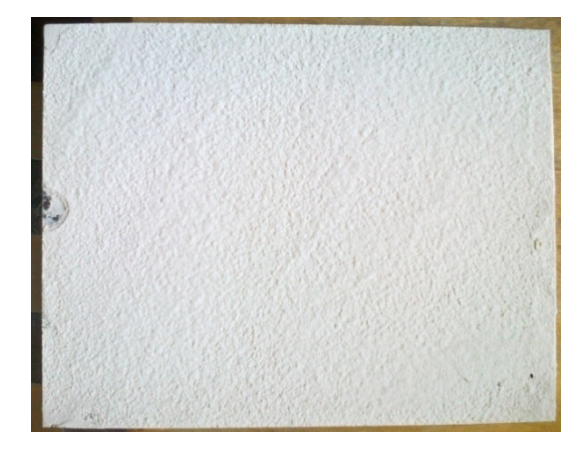
Fig. 4. Ceramic shell layer with Sizol030 binder modified with 1 mass% of C_{14}H_{10}O_4

The above mentioned ceramic layers were obtained under the comparable conditions, at the identical air humidity, temperature, and at the same air motion rate over the specimens. The influence of benzoyl peroxide on the quality and thickness uniformity of the obtained ceramic layers was confirmed. The specimen layers obtained on the basis of pure colloidal silica are characterised by multiple cracks occurring during the dehydration process. The obtained surface is discontinuous and deformed. The specimens made of the material modified with benzoyl peroxide exhibit the uniform thickness of the applied layer and there is no visible defects in the form of cracks characteristic for the specimens obtained on the basis of the non-modified binder.