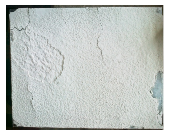
Fig. 2. Ceramic shell layer with pure Sizol030 binder

The obtained specimens of moulding material were visually checked. Observation results concerning the quality of the achieved ceramic layer are presented in Figs. 2-4.