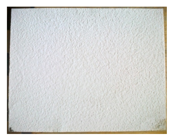
Fig. 3. Ceramic shell layer with Sizo1030 binder modified with 0.5 mass% of C_{14}H_{10}O_4