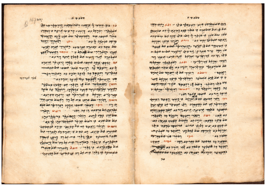
1. Manuscript No. JSul.III.02. A translation of the Book of Kings