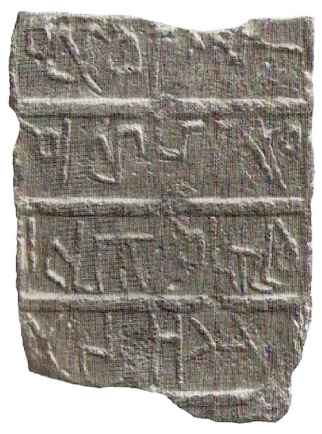
Tayma' inscription (Louvre, AO 26599)

1) mbr' z qrb 2) Mzmw br Rgzm 3) ml l-'lm Lht z 4) 'l hy' This building (was) offered (by) Mzmw, son of Rgzm, (in) full title for feasting this Goddess, for the life of [...]