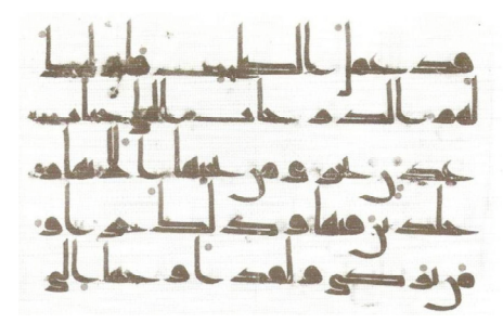
Vellum leaf of a Qur'ān manuscript (8 x 13 cm.) from the 10th century A.D., probably from Kairouan, written in Kufic script with only a few diacritics marked in red

Considering the problematic or obscure Qur'anic passages one should accept the possibility of mistakenly added diacritics. For instance, St. John the Baptist is called Yahy\bar{a} in the present punctuation of the Qur' \bar{a}n^{13} , but the consonants also allow the reading Yuḥannā, which probably corresponds to an early pronunciation of the name. In fact, when the Mandaeans introduced John the Baptist in their literary tradition to show to the Muslims that they have a Prophet recognized in the Qur'an, they first called him Y\bar{o}hann\bar{a} , as shown by his mentions in the Ginza, their earliest sacred book. Later, in the so-called John-Book, they mainly use the name Yahyā<sup>14</sup>. This punctuation was very likely chosen by Muslim scholars because Yuhannā does not appear in Arabic onomastics, while Yahy\bar{a} is a well attested name, occurring already in Safaitic inscriptions 15.