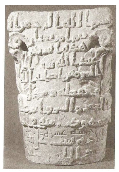
Capital from Al-Muwaqqar (Ammān, Archaeological Museum, J. 5058)

However, a serious question can be raised because of the lack of diacritics and vowel signs in the early manuscripts of the Qur'ān. The shape of one character has no less than five reading possibilities (b, t, \underline{t}, n, y) , if the diacritical dots are missing, while other have three (\check{g}, h, h) or two possibilities (d \text{ and } \underline{d}, r \text{ and } z, s \text{ and } \check{s}, s \text{ and } \dot{d}, t \text{ and } z, s' \text{ and } \dot{g}) . This situation results from the use of the cursive post-Nabataean script to write the Qur'ān in the mid-7th century. This Aramaic script was not distinguishing a number of phonemes existing in spoken Arabic; besides, it was lacking diacritics and vowel signs. Both were progressively introduced, following the Syriac example 11. The earliest attestation of diacritics in Arabic is found in an inscription from 58 A.H. and their use was slowly generalized in the 8th and 9th centuries 12. In the early Islamic period, two types of Arabic writing existed, known as Kufic and cursive nash\bar{t} . The former was discontinued except for formal purposes, where cursive writing could not be employed. The nash\bar{t} is the parent of usual and modern Arabic writing.