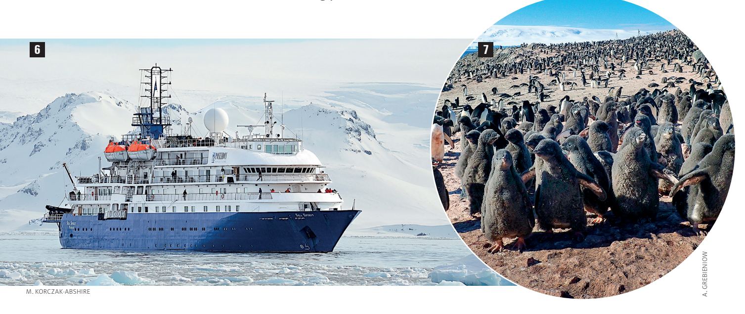
Photo 6 An important aspect of Antarctic tourism is education about polar regions and the research conducted there. Here: a tourist ship off the coast of King George Island

Photo 7 Chicks of Adélie penguins, consumers of Antarctic krill