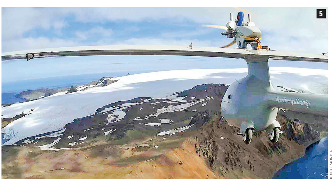
Photo 5 The PW-Zoom unmanned aerial vehicle during a photogrammetric mission over King George Island

Photo 4 The Arctowski Polish Antarctic Station and its surroundings on King George Island, South Shetland Islands. Aerial view captured by a long-range unmanned aerial vehicle