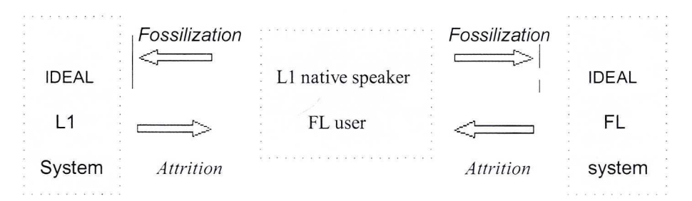
Fig. 3. Interlanguage continuum