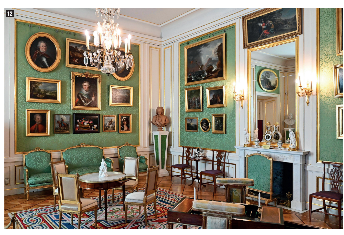
Photo 12 Green Room, with a bust of Voltaire by Jean-Antoine Houdon dating from 1778 visible in the corner

Photos 10, 11 Conference Room with original fragments of mural decoration by Jan Bogumił Plersch, 1783