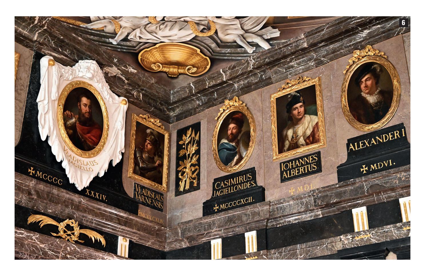
Photo 6 Marble Room, portraits of Polish kings by Marcello Bacciarelli