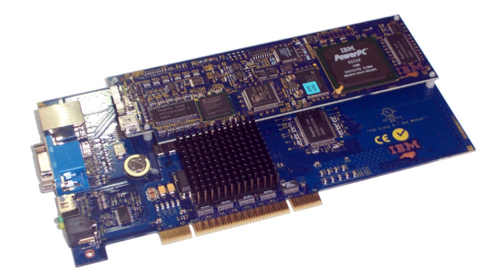
Fig. 3. Remote Supervisor Adapter II card, which generated predictable keys for several years.

The study found 17 vulnerable keys in the first set and no vulnerable keys in the second set. 14 keys were generated in 2007 in IBM's Remote Supervisor Adapter II (RSAII) server access and management cards (Fig. 3). The cause of the vulnerable keys is a problem identified by the vulnerability identifier CVE-2012-2187. These cards use only 9 different key factors, which allows only 36 unique public keys to be generated. The rest of the vulnerable keys (3 pieces) are