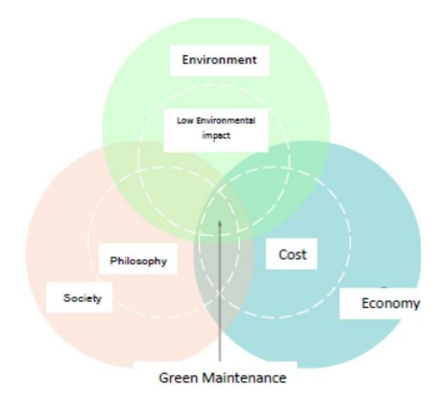
Fig. 1. Conceptual Model of Green Conservation, Source: (Kayan et al., 2017; Kayan et al., 2018)

It is noted in the literature and concepts mentioned above that the global transformation into a sustainable, environmentally friendly economy made companies face the challenge of shifting towards green operations of supplying, manufacturing and marketing, as well as maintenance operations, which are an integral link in this direction to achieve competitive advantage or exit from the markets. Green maintenance is a method for maintaining devices and equipment aimed at eliminating waste and environmental impacts associated with the maintenance process and optimizing the use of available resources.