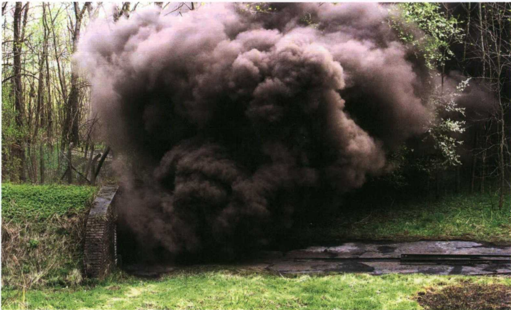
A methane explosion captured on film, at the "Barbara" Experimental Mine in Mikołów