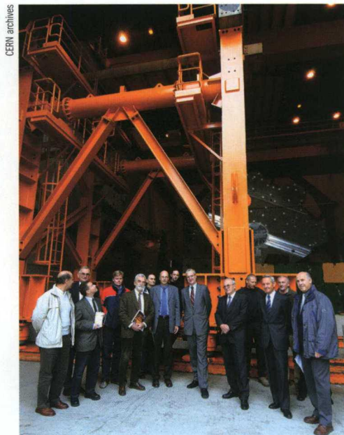
These supports, meant to bear the calorimeters of the ATLAS experiment (weighing 1800 tons), were made in Poland

The Large Hadron Collider has been built inside an underground tunnel 27 km in circumference dug for the purposes of a previous accelerator, in stable bedrock some 100 m under the surface. The LHC is a ring accelerator, in which particles sped up to higher and higher energies move along circular orbits inside vacuum pipes, their trajectories guided by magnets – the greater the energy (momentum) of the particles, the greater the intensity of the magnetic fields is needed. This circular configuration simplifies the process of acceleration: particles repeatedly pass through the points where additional energy is imparted to them, and moreover collisions become more likely since they repeatedly cross the “intersections” (points where the particle orbits