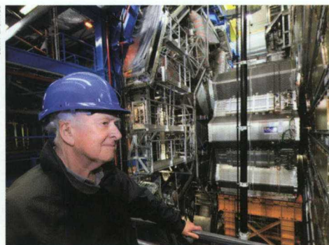
Prof. P.W. Higgs himself, visiting the gallery of the ATLAS experiment (4 April 2008)