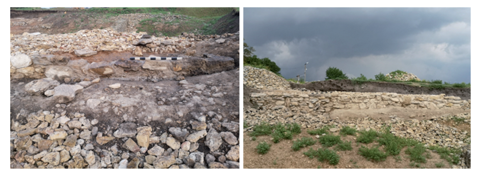
Fig. 4. Wall located in the Tanais archaeological excavation before (on the left) and after (on the right) conservation work in 2019

As the last part of the conservation work, the protection and stabilization of a section of the eastern side of the excavation were carried out (right blue area in Fig. 1). A retaining wall was constructed from stone elements in the trench (lying loosely and not connected with the existing masonry relics) and outside the excavation. The construction of the masonry is layered, in the lower part made from 2–3 rows of elements, in the upper part from one row of stone. The state of the wall before and after the conservation work can be seen in Fig. 4.