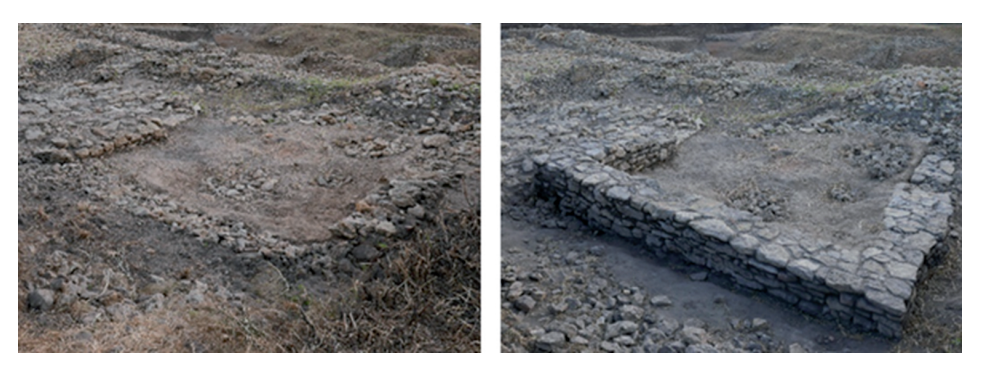
Fig. 2. Walls of the chamber located in the Tanais archaeological excavation before (on the left) and after (on the right) conservation work in 2017

CONSERVATION WORKS IN TANAIS ARCHAEOLOGICAL SITE IN YEARS 2016–2019 161