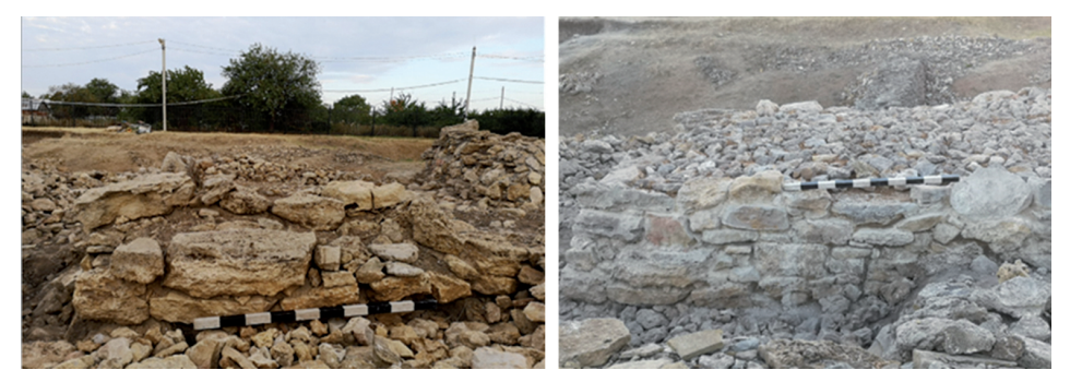
Fig. 3. Wall located in the Tanais archaeological excavation before (on the left) and after (on the right) conservation work in 2018

The state of the structure before and after the conservation work can be seen in Fig. 3.