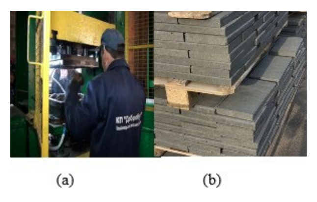
Fig. 4. Production process (a) and appearance (b) of paving slabs produced by CE "Dobrobut" of Illintsi community

Rys. 4. Proces produkcyjny (A) i wygląd (B) płyt brukowania wyprodukowany przez CE "Dobrobut" gminy Illintsi