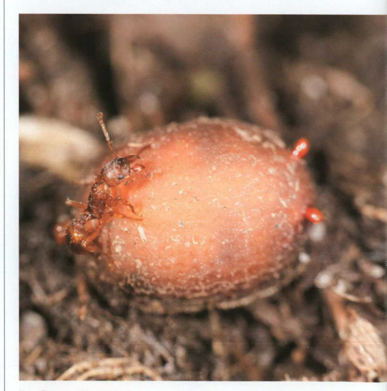
Hoverfly pupa with a host ant

Myrmica ants, also referred to red ants, are averagesized insects, red in color, which can be encountered in many different habitats, including xerothermic grass-