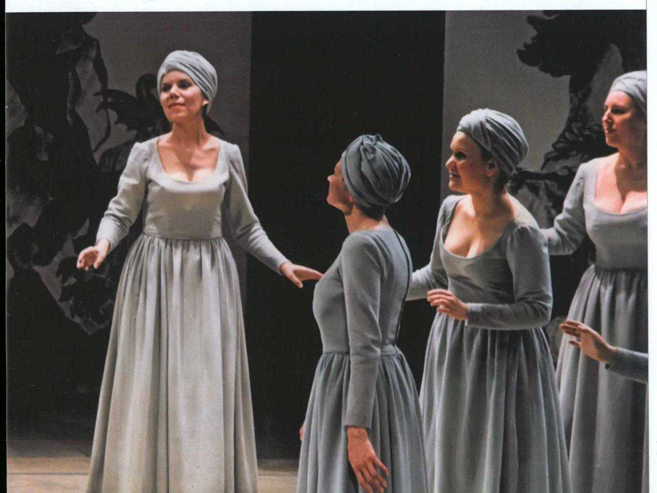
Photo 1: Francesca Caccini's opera "Salvation of Ruggiero from the Alcyna Islands" (Italian performance in 1625) dedicated to the Polish prince Ladislaus Vasa, opera was staged in Poland after more than three hundred years by the Warsaw Chamber Opera

Despite the poor state of preservation of the surviving sources, it can be said that the participation of local musicians in the ensembles of Polish kings continued to increase in the successive decades of the 17th century. At the same time they were joined by newcomers from the German countries and France. Here it is worth noting that although the ensembles