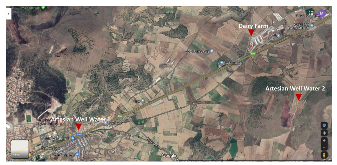
Fig 1. Location of the dairy farm and water resources