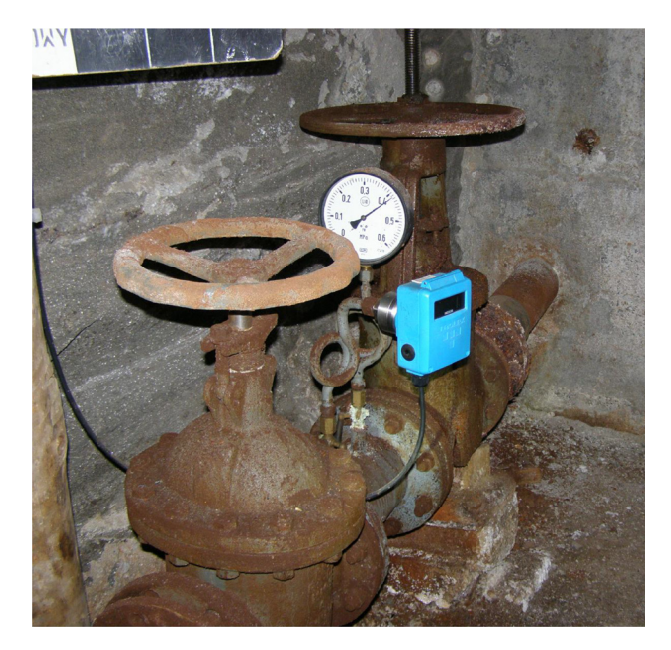
Photo 1. Water dam with dewatering pipeline and gauges in the longitudinal working Gussmann in level V

For controlling the pressure of water beyond the dams, pipelines were conducted through them and gauges installed before the dams. Owing to the similarity of the described effect, only the end part of the longitudinal working Gussmann in level V was presented in photo 1.