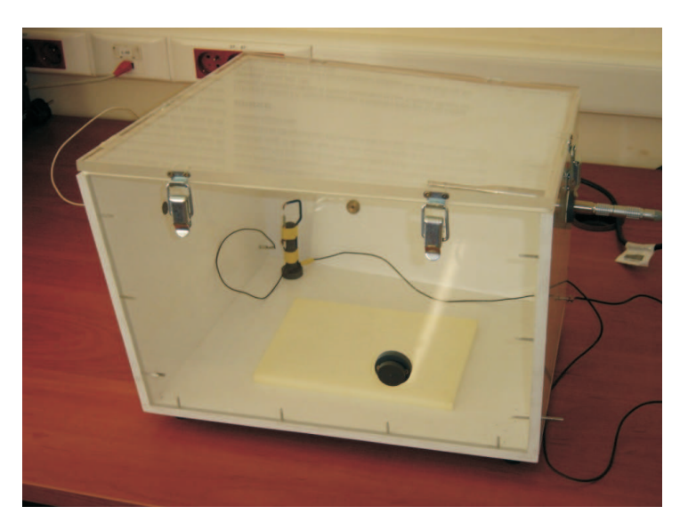
Fig. 1. The chamber for measuring of the sound absorption coefficient in ultrasonic frequency range.