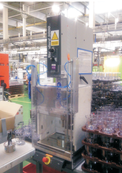
Fig. 4. The welding machine before and after rebuilding, i.e. with the sound-absorbing and insulating enclosure.