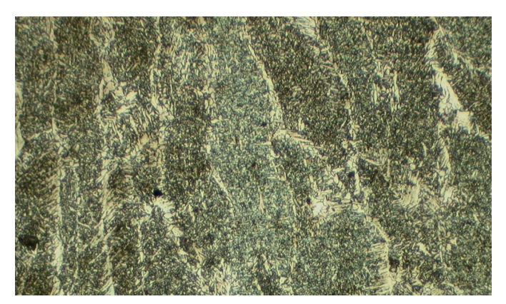
Fig. 3. Microstructure of WMD (63% of acicular ferrite) after MIG welding with micro-jet cooling of gas mixture (33% argon, 67% air), magn. 200x

Analyzing tables 3 it is easy to deduce that welding with micro-jet cooling must be treated as a very good option. Amount of acicular ferrite in WMD after MIG welding without micro-jet cooling was only on the level of 48%. It is also shown that argon pressure as a micro-jet gas after MIG welding should be on the level of 0.4 MPa or even better 0.5 MPa, and stream diameter of micro-jet cooling gas should be on the level of 40 \mu m or 50 \mu m. These parameters correspond with the most beneficial amount of oxygen in WMD on the level of 350 ppm and consequently with 71% of acicular ferrite). Acicular ferrite with high percentage above 60% in WMD after welding with gas mixture argon-air was gettable only once (67% Ar). Thus it is easy to deduce that micro-jet cooling has strong influence on metallographic structure (Fig. 3).