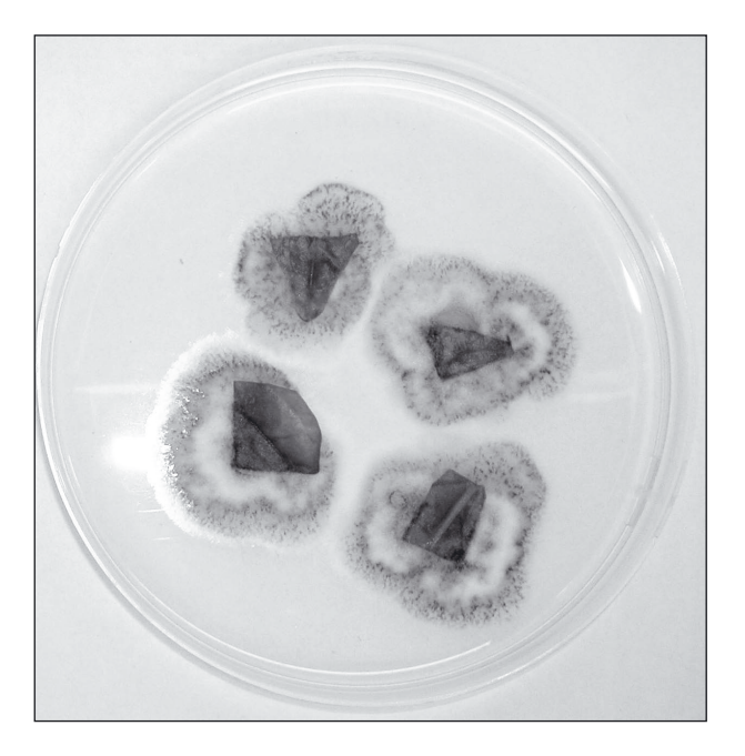
Fig. 2. Emergence of endophytic Colletotrichum truncatum mycelium from inoculated, symptomless leaves of Capsicum annuum [4 weeks after inoculation (WAI)] on Potato Dextrose Agar (PDA) medium 3 days after culturing

WAI - weeks after inoculation; PDA - Potato Dextrose Agar