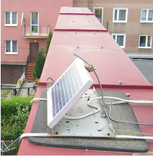
Fig. 2. Experimental PV module installation (second site)

in Tab. IV. Module power has been rated for Standard Test Conditions (STC, irradiance 1000 W/m 2 , temperature 25 °C, air mass 1.5). In this location, tilt angle has been selected to improve performance of a stand-alone PV system during autumn and winter [19]. There are no near obstacles (like trees or buildings) that could cause shading. The solar module has been inspected and cleaned regularly. All the maintenance procedures have been carried out during nights only, in order to keep consistency of records. In our research we have collected and processed over two years of GTI data.