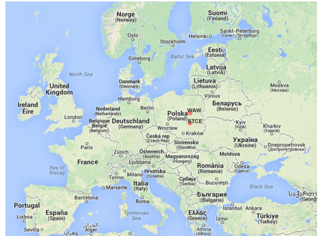
Fig. 1. Geographical location of ground stations