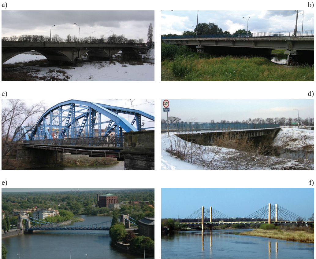
Fig. 1. View of the bridges [16]: a) Bolesław Chrobry (Swojczycki), b) Bolesław Krzywousty, c) Władysława Sikorski, d) Polanowicki, e) Grunwaldzki, f) Milenijny [16]