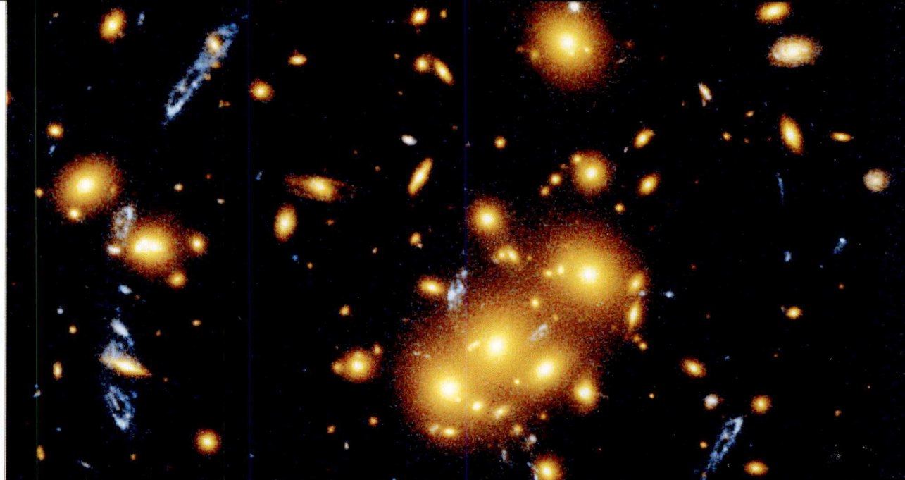
Hubble Space Telescope

Galaxies gravitationally lensed by a galaxy cluster