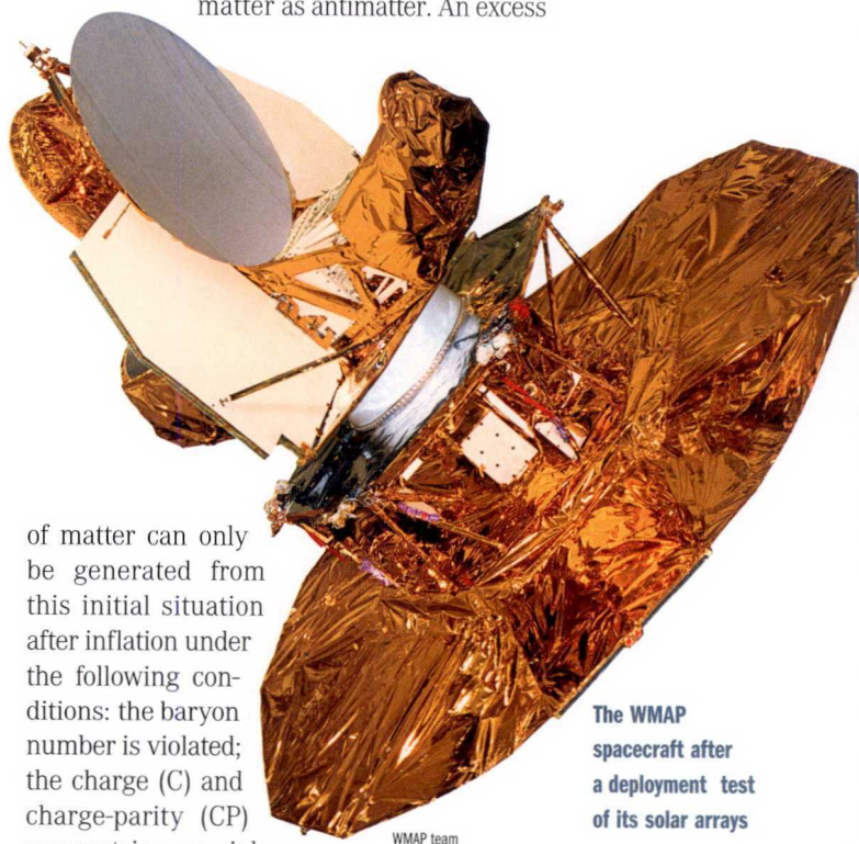
The WMAP spacecraft after a deployment test of its solar arrays

which later served as the seeds of cosmic structure - superclusters, clusters and galaxies. It was the beginning of structure formation. In inflationary models, the universe starts with a net baryon number very close to zero; at the beginning, there was as much matter as antimatter. An excess