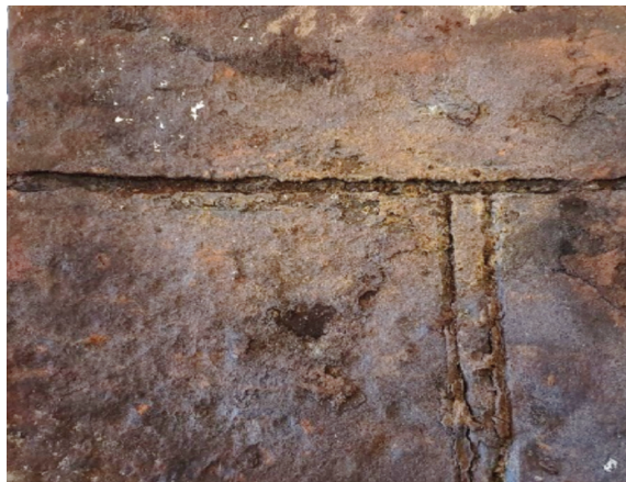
Fig. 2. DN 800 water pipeline – corroded section of the longitudinal seam and butt circumferential weld above

Failures of pipelines for transporting technological water and pipelines for transporting post-flotation waste were analyzed. The distinguished types of pipelines are characterized by different properties, despite the use of the same materials. Pipelines for transporting water are not subject to intense abrasive wear. The most important cause of failure is corrosion, especially local corrosion of longitudinal seams. These pipelines are covered from the inside with a dense, absorbent, permeable layer of corrosion products. It is extremely difficult to diagnose their condition due to the precipitation and deposition of sediments, the lack of free access and the required availability. Figure 2 shows the corroded section of the longitudinal seam and the circumferential weld connecting the DN 800 water pipelines.