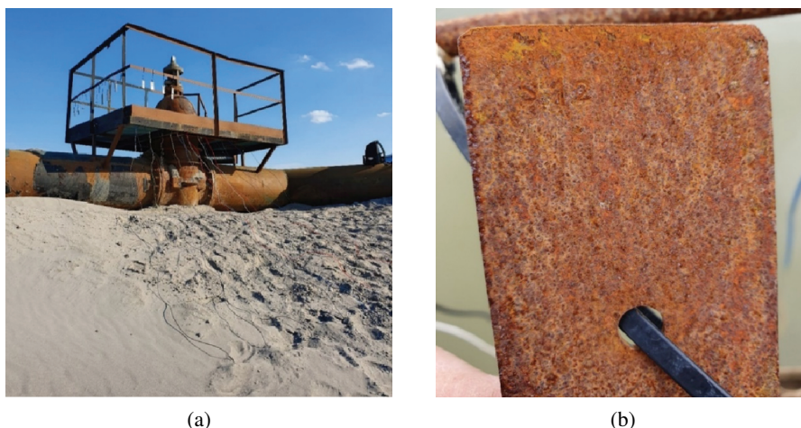
Fig. 4. Exposure of corrosion coupons: a) corrosion coupons, various types of steel – exposure in air and in post-flotation tailings – OUOW Żelazny Most , Western Dam, b) corrosion coupon made of S235JR steel after four months of exposure to air – filtration water reservoir, Tarnówek pumping station

and technical infrastructure belonging to the Hydrotechnical Plant. It was decided that the coupons should be exposed to water, flotation tailings and air. Single steel coupons: 1.4301, 1.4462, 1.4404, 1.4307, 1.4571 and S235JR were installed in January 2021. In May 2021, single steel coupons were installed: 1.4410, 1.4539, Inconel 600 (Alloy 600) and double coupons, tightly adjoining (bolted) steel: 1.4539, Inconel 600, 1.4410, 1.4301, 1.4462, 1.4307, 1.4404 in order to investigate the occurrence of crevice corrosion. In addition, single corrosion coupons with a zinc metallization coating were installed, applied to the metal substrate using the spray metallization method. The minimum layer thickness is 150 \mu\text{m} . Figure 4a shows the exposure of corrosion coupons installed in the Żelazny Most tailings pond (western dam) – exposure in post-flotation tailings and exposure in the air. On the other hand, Figure 4b shows the corrosion coupon made of S235JR steel after four months of exposure to air. The place of exposure was the filtration water tank of the Tarnówek pumping station. The aim of the study is to answer the question of how the selected types of steel behave in the conditions of the Hydrotechnical Plant, and ultimately the appropriate and optimal selection of construction materials.