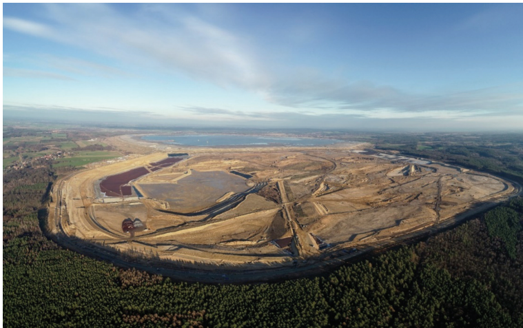
Fig. 1. The Źelazny Most tailings storage facility (OUOW) with the South Headquarters under construction – the main building of the Hydrotechnical Department

Figure 1 shows the Źelazny Most tailings storage facility (OUOW) with the South Quarter which is currently under construction.