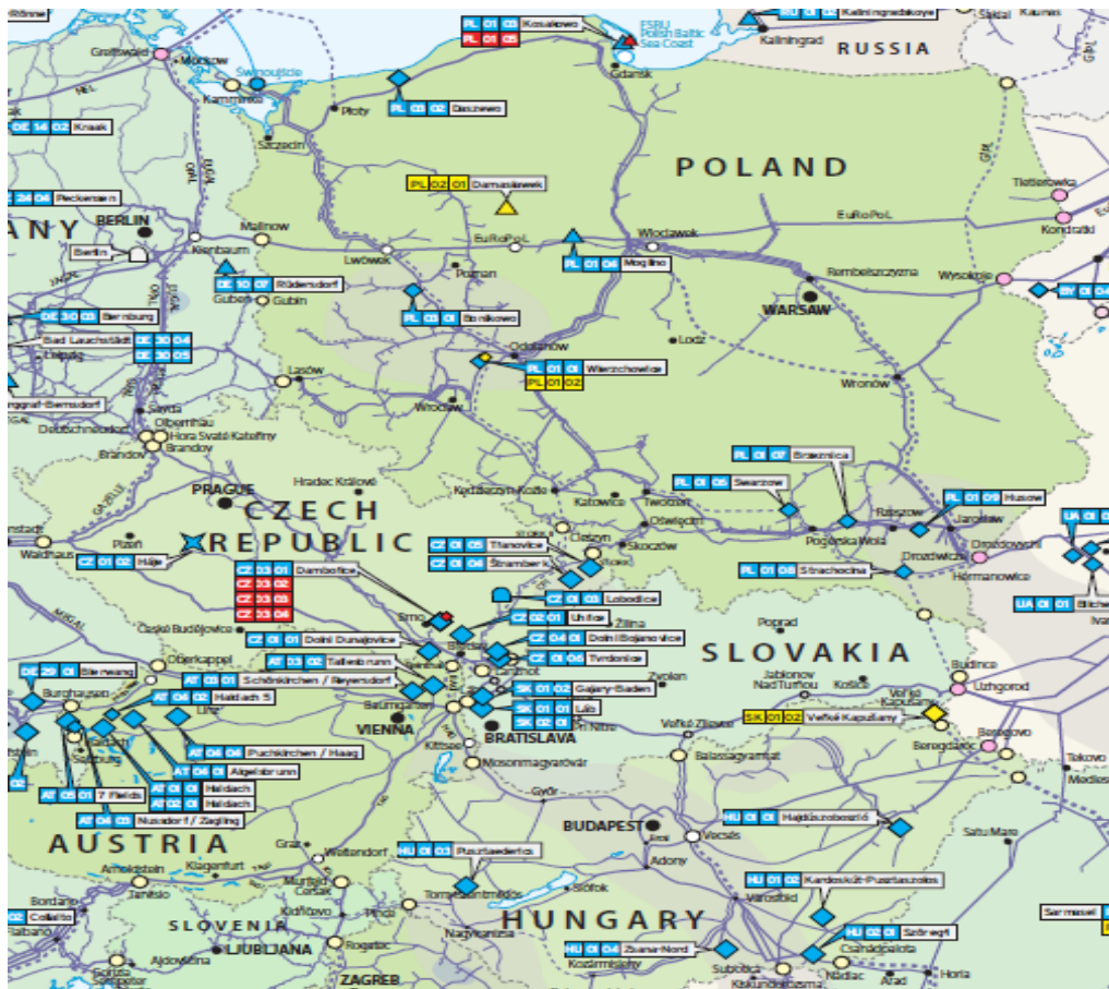
Fig. 2. UGSF of Poland, Hungary, Czech Republic and Slovakia

At the same time, all Slovak gas storage facilities are located in the same region. It is the highest concentration of available UGSF capacity in a country in one place compared to other Visegrad Group countries. Such concentration of storage facilities in one region is in this case conducive to supplying gas to the market (distribution of industrial infrastructure) and safe in case of terrorist attacks. Obviously, such distribution is also connected with geological conditions. It is no coincidence that the only UGSF in central Czechia is located in a system of tunnels carved out in rock.