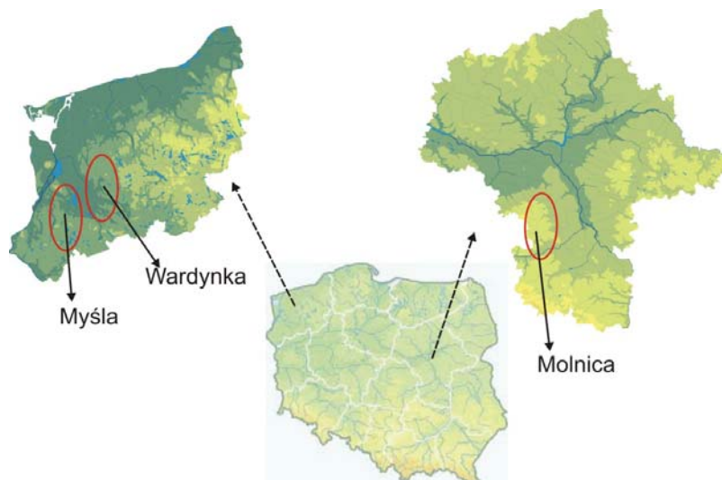
Fig. 1. Localisation of the rivers Molnica, Myśla and Wardynka; source: own elaboration

In the laboratory, the fish were measured from the end of the fish mouth to the end of the longer flap of the caudal fin ( TL ) and from the tip of the fish mouth to the back edge of the last vertebra (body length – SL ) to the nearest