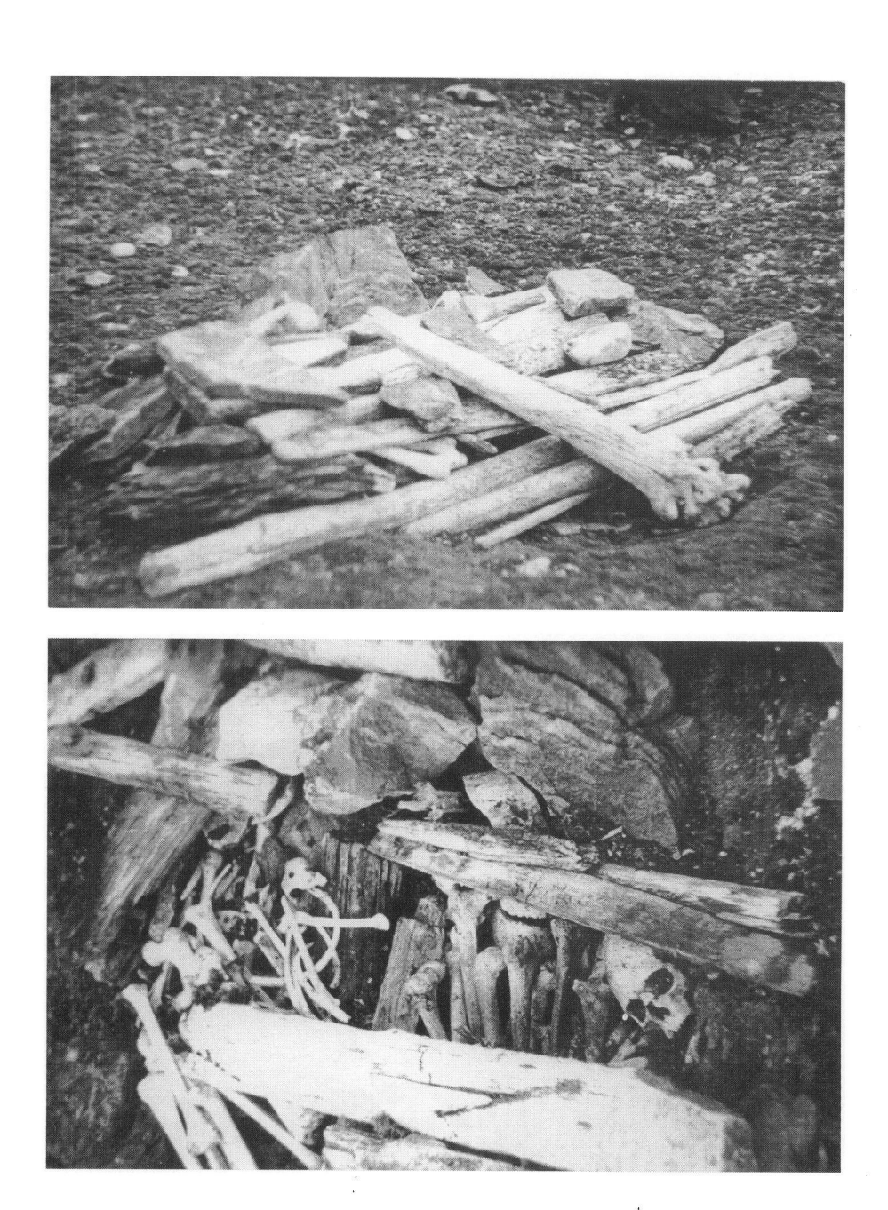
Fig. 2. State of the common grave on Store Dunøya in 1984.