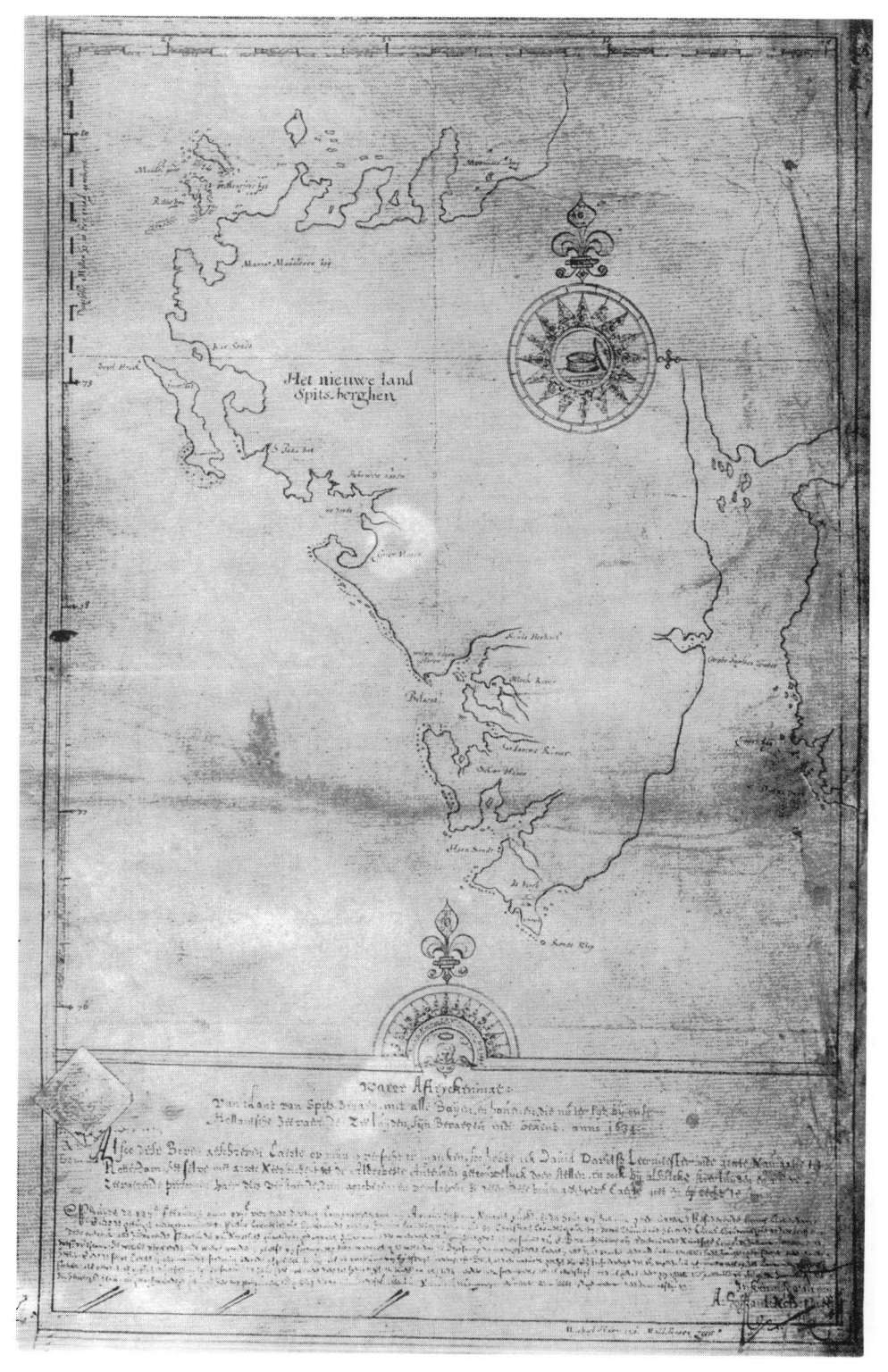
Fig. 1. Map of Michel Hsz. Middelhoven from 1634. After Schilder (1988)