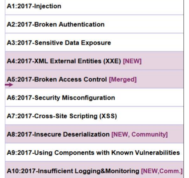
Fig. 3. OWASP top 10 vulnerabilities for web applications [13]

The proposed approach to calculate security level metric of the solutions deployed in the cloud environment is as follows: