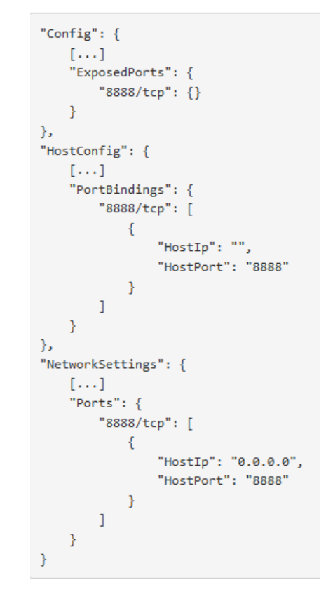
Fig. 2. An exemplary configuration of the dockerfile

If we are considering the security of applications, there are two sets of tests to be mentioned: automatic security tests (done by a specific tools) and manual penetration testing (done by a qualified expert). The latter is always more accurate (a human can try to examine context which machines typically do not understand) but in environments like the one we are mentioning in this paper (where changes are deployed frequently) it is almost impossible to implement. The main reason for this is the time which an expert needs to perform the penetration test. During the time required for performing a single test, a team of developers could prepare several changes. Thus, waiting for the test to be completed delays the release of application version which is ready to be put on production infrastructure(one of the key reasons why to switch to DevOps methodology is related to shorter releases time).