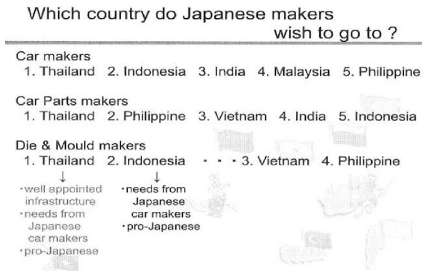
Fig. 1. Countries chosen by Japan, in order of preference, for investment in the automotive industry and related industries [2]

by Indonesia and Vietnam. It can be seen that Japan tends to choose Thailand first when considering investment in the industries mentioned above [2], as shown in Fig. 1.