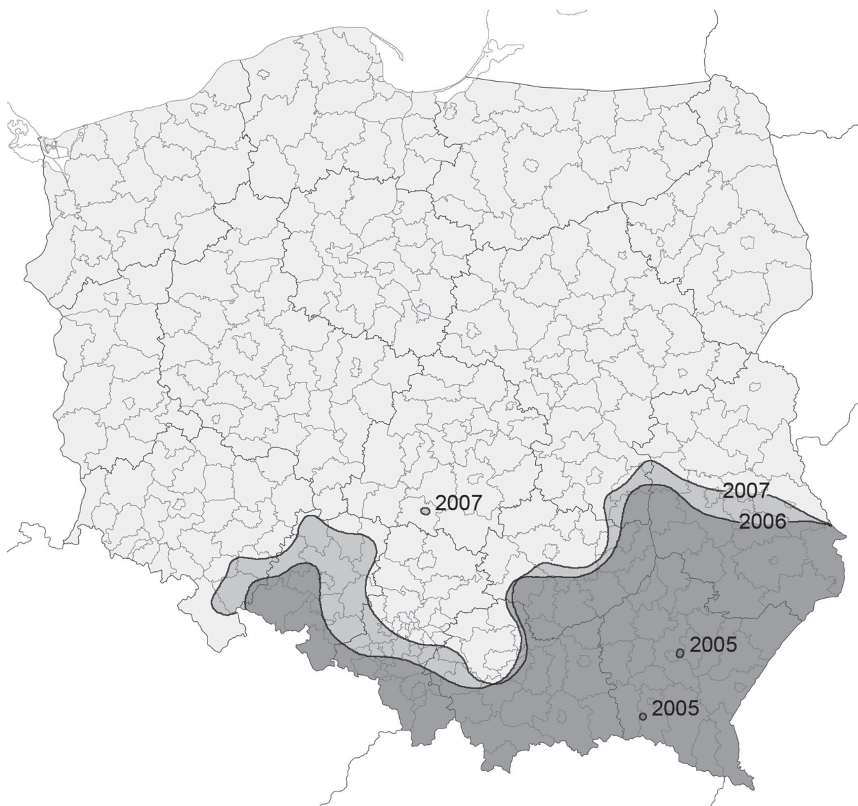
Fig. 1. The distribution range of Diabrotica virgifera Le Conte in Poland in 2005–2007

In 2006, as a result of very intensive monitoring based on pheromone sticky traps and visual examination of maize plants in the field, D. virgifera was also detected, but on a much larger scale than in 2005. Its range of distribution included the territory of voivodeship podkarpackie and some areas of neighbouring voivodeships: lubelskie, świętokrzyskie, małopolskie, mazowieckie, śląskie, opolskie and dolnośląskie. Very high speed of the pest's colonization was connected with the increase of the number of pest's population. According to SPHSIS's data, ca. 17 500 beetles were collected in ca. 200 outbreaks. Outbreaks in the largest number – 112 were located in voivodeship podkarpackie and ca. 14 500 beetles were collected there.