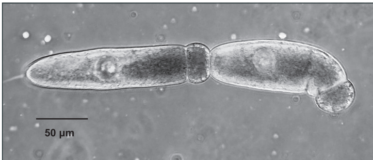
Fig. 2. Association of gamonts of Gregarina vizri recorded in an adult Zabrus tenebrioides in Poland

The parasitism level of Z. tenebrioides by G. vizri in Poland reached the level of 42% among 45 specimens examined. It was much higher than in Russia, where only 3 larvae out of 25 studied specimens were infected (Lipa 1968).