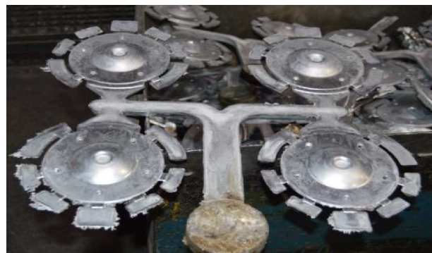
Fig. 1. Casts in four-time form [13].

Material must be recasted in the smelter, after that it is tapped to transport containers, which are transmitted to machines for casting under the pressure. Short flange is casted four times in the machine MW 550. It means 4 casts are made by one process of casting, Fig. 1.