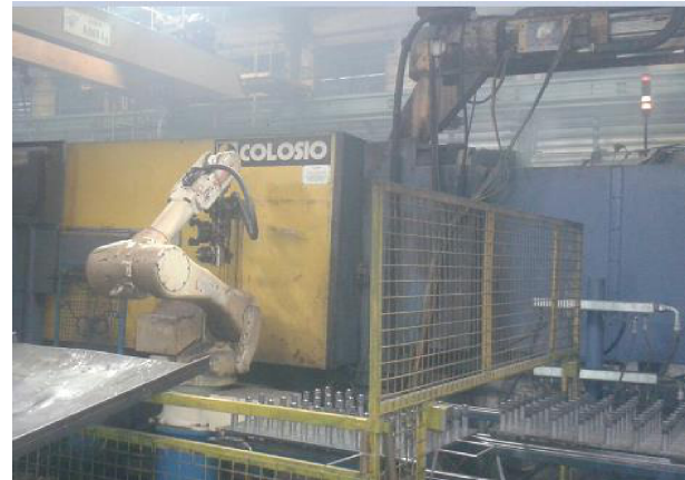
Fig. 3. Colosio PF01000 with robot Kawasaki [13].

functions by the type of menu, software aimed at pressure outflow, Fig. 3.