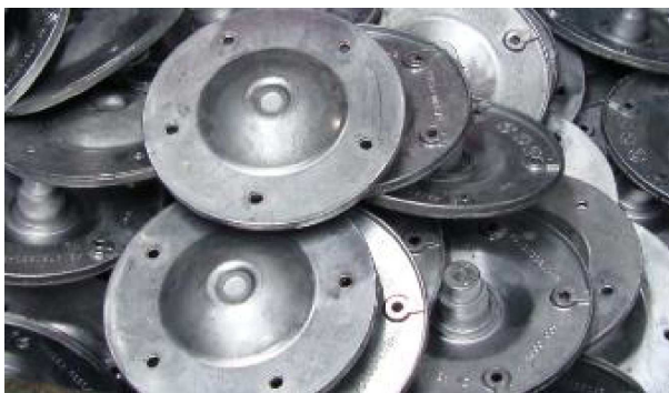
Fig. 2. Final product – short flange [13].

Each cast must fulfill the parameters and it has to satisfy requirements of customer, Fig. 2.